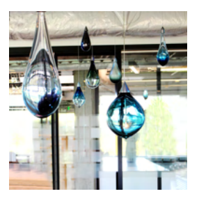
GO.0.gle Oversized - I mean gigantic blown glass water droplets were so fun to make for this office building mini kitchen.

The large executive boardroom chandelier at the Marriott Seattle is based on sea forms of the Puget Sound.