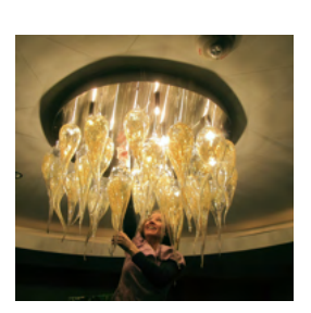
Marriott I love hospitality projects!

GOING LARGE! The newest installation is a pendant cluster made of EXTRA LARGE blown glass globes. Layered with precious metals and engraved in Italian Battuto style create a unique look.